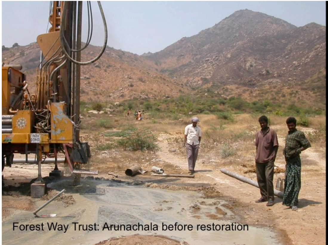
Forest Way Trust: Arunachala before restoration

Forest Way Trust works on the restoration of the sacred mountain Arunachala, in the Eastern Ghats near the town of Thiruvannamalai.